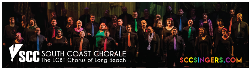
SCC SOUTH COAST CHORALE The LGBT Chorus of Long Beach