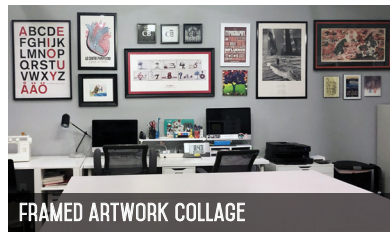
FRAMED ARTWORK COLLAGE

Among the rest of our home projects, here are our top three honorable mentions of 2019: