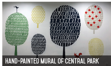
HAND-PAINTED MURAL OF CENTRAL PARK

1 Location: Office Duration: 1 day Supplies: Nails, hanging hooks, hammer, a level, and good math skills