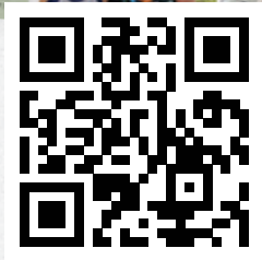
check out our video profile on YouTube