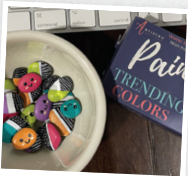
Latest hobby: Rock painting