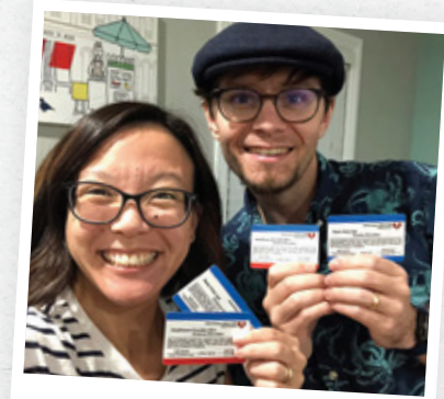
CPR and First Aid certified